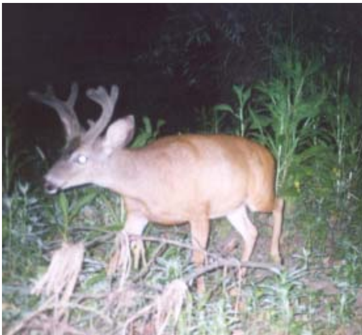
Mule deer buck with a nice rack caught in San Diego Tracking Team remote camera at night in Peñasquitos Canyon Preserve.