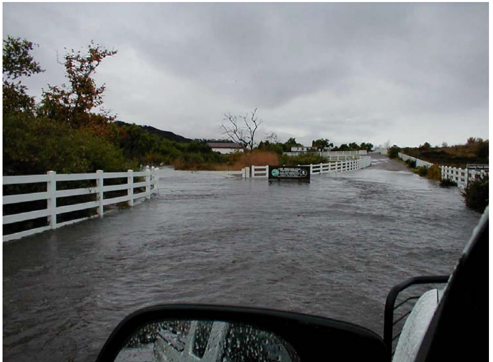
Flooding around the historic ranch house in Peñasquitos Canyon Preserve during the October rains.