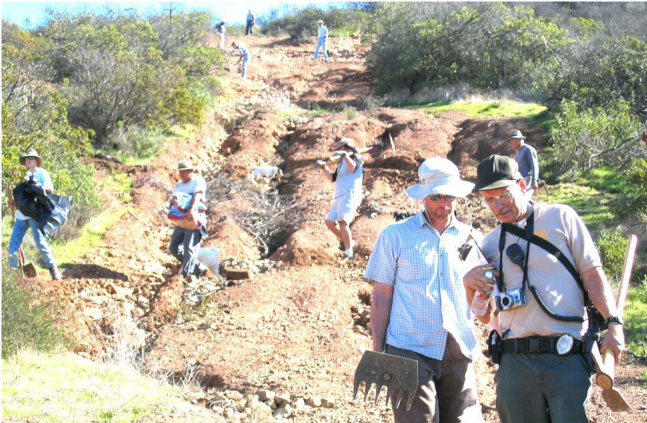
Volunteers reworking a heavily eroded area on Black Mountain into a trail and revegetated area.

If you would like to volunteer, (its fun!) please contact Senior Park Ranger Lori Charett Gerbac at (858) 538-8082 or Ranger Tom Miller at (858) 538-8021. We also need donations of planting and erosion control materials.