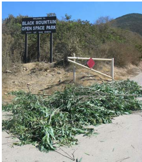
Illegal dumping at the entrance to Black Mountain Open Space Park