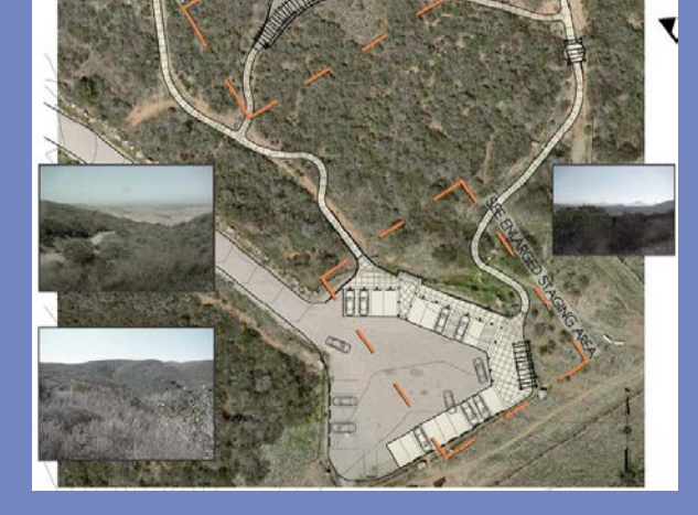
Trail for All People Conceptual Design.

For news on our Lake Hodges Oak Woodland Restoration visit the new website of the Del Dios Habitat Protection League: http://www.ddhpl.org/